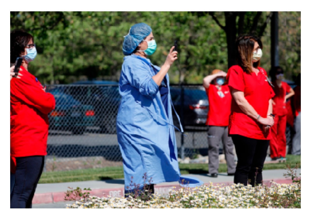
SAN JOSE, CALIFORNIA - APRIL 23: Healthcare workers protest outside of Regional Medical Center in San Jose, Calif., on Thursday, April 23, 2020. They were protesting the planned closure of Women's Services.