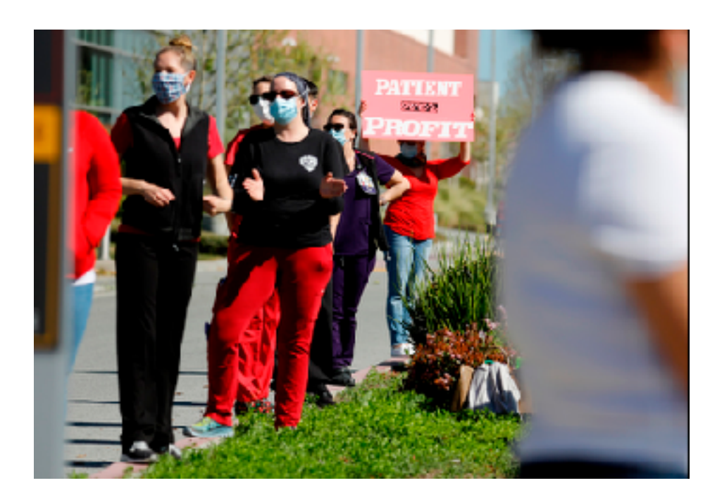
SAN JOSE, CALIFORNIA - APRIL 23: Healthcare workers protest outside of Regional Medical Center in San Jose, Calif., on Thursday, April 23, 2020. They were protesting the planned closure of Women's Services.