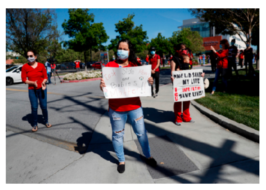
SAN JOSE, CALIFORNIA - APRIL 23: Healthcare workers protest outside of Regional Medical Center in San Jose, Calif., on Thursday, April 23, 2020. They were protesting the planned closure of Women's Services.