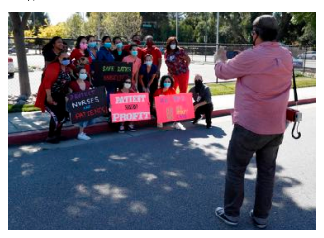
SAN JOSE, CALIFORNIA - APRIL 23: Healthcare workers, mostly nurses, pose for a photograph after protesting outside of Regional Medical Center in San Jose, Calif., on Thursday, April 23, 2020. They were protesting the planned closure of Women's Services.