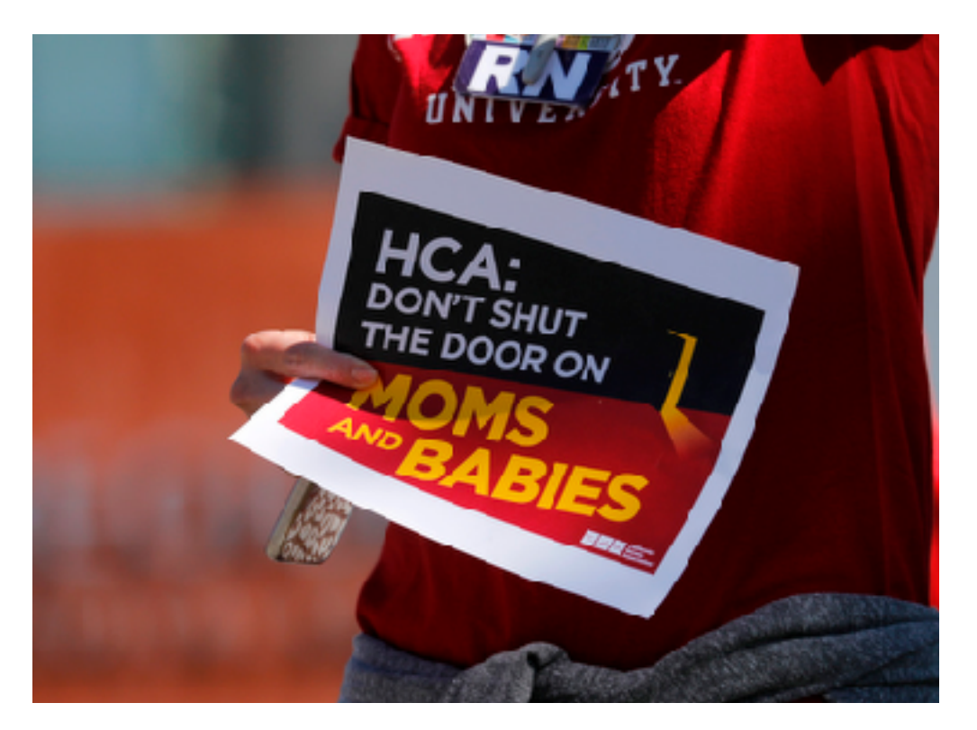
SAN JOSE, CALIFORNIA - APRIL 23: A registered nurse hold a sign outside of Regional Medical Center in San Jose, Calif., on Thursday, April 23, 2020. They were protesting the planned closure of Women's Services.