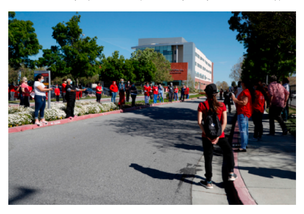
SAN JOSE, CALIFORNIA - APRIL 23: Healthcare workers protest outside of Regional Medical Center in San Jose, Calif., on Thursday, April 23, 2020. They were protesting the planned closure of Women's Services.