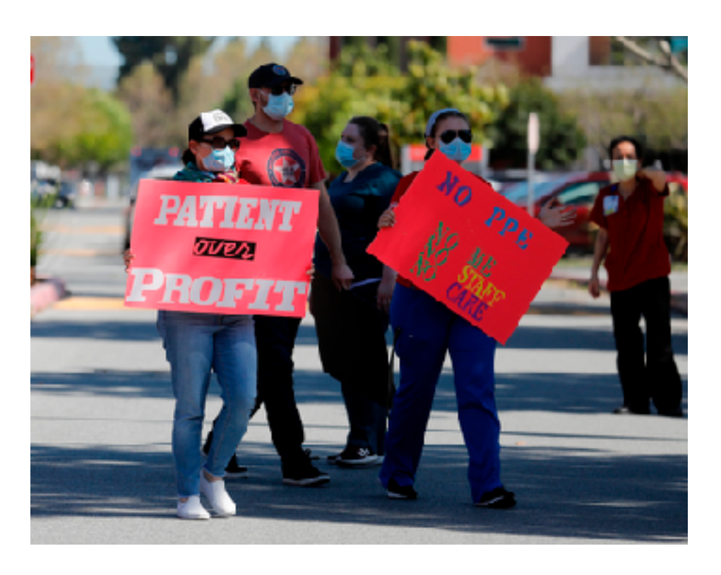
SAN JOSE, CALIFORNIA - APRIL 23: Healthcare workers protest outside of Regional Medical Center in San Jose, Calif., on Thursday, April 23, 2020. They were protesting the planned closure of Women's Services.