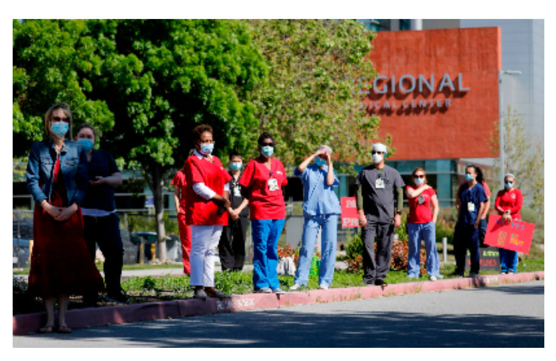
SAN JOSE, CALIFORNIA - APRIL 23: Healthcare workers protest outside of Regional Medical Center in San Jose, Calif., on Thursday, April 23, 2020. They were protesting the planned closure of Women's Services.