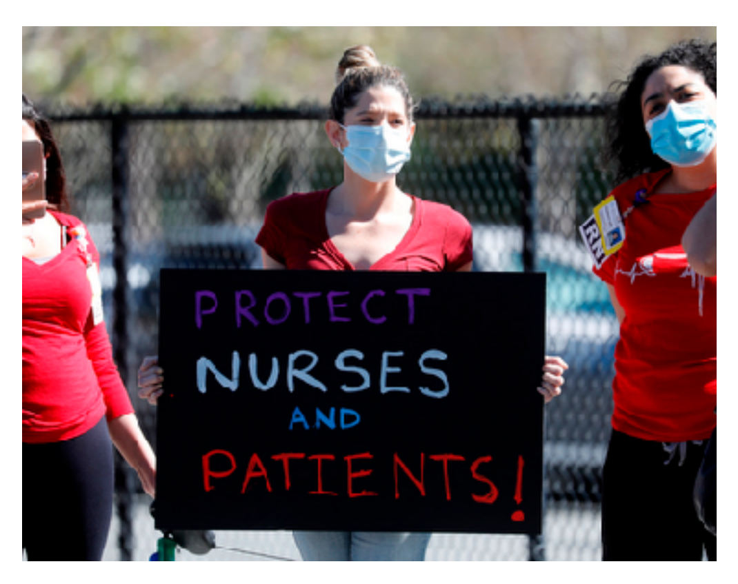
SAN JOSE, CALIFORNIA - APRIL 23: Nurses protest outside of Regional Medical Center in San Jose, Calif., on Thursday, April 23, 2020. They were protesting the planned closure of Women's Services.